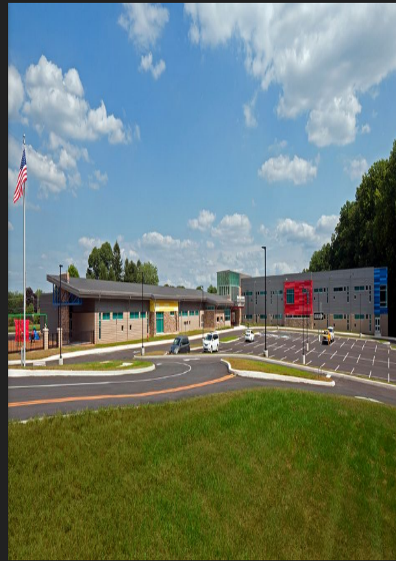
This is William F. Cooke, Jr. Elementary.